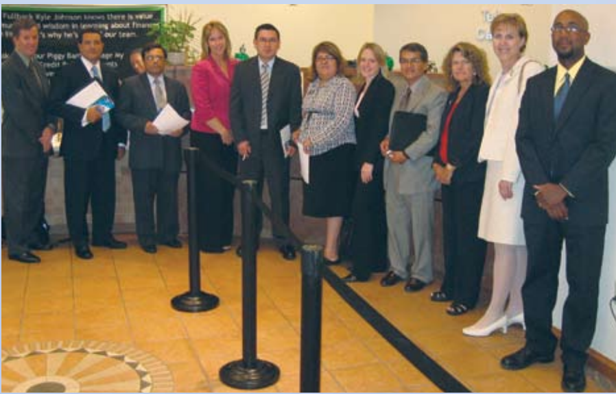
Representatives from Credit Union Association of Colorado (CUAC), Credit Union Service Network (CUSN) and Denver Community FCU staff members welcome the International Partnership delegation from World Council and Ecuador.