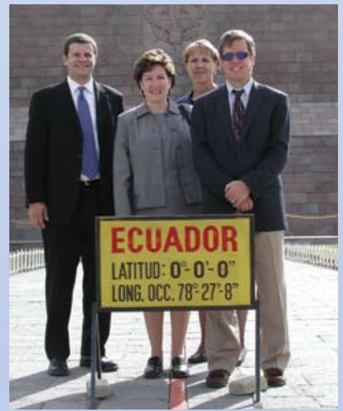
The International Partnership Delegation from CUSN and CUSC stand where the northern and southern hemispheres meet in Quito.