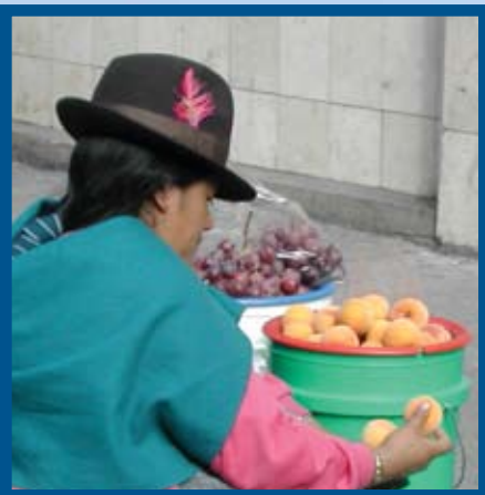
An Ecuadorian woman compares fruit that she is selling in the street market.

“As U.S. credit unions search for ways to make a positive social impact,