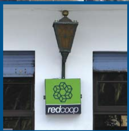
The Redcoop logo, shown on the exterior of CACPECO Credit Union, signals to members that a credit union is part of the shared branching network.